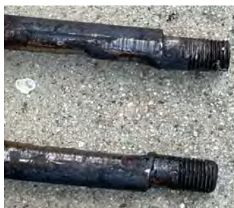
Close up of worn shackle.