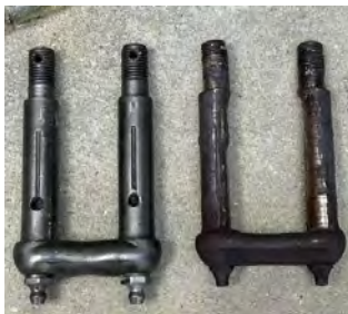
Side-by-side comparison to new shackle (left) and old (right)

You just never know when one of those might break and let the leaf spring fly!!!!