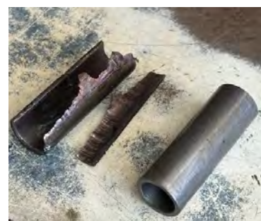
Worn spring bushing (left) with new (right)